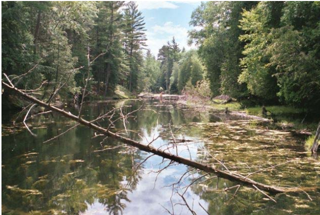
Ausable River valley tributary on the "Dam Trip"

New Hampshire adventures also available!